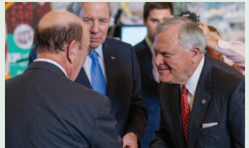
Gov. Nathan Deal (right) and U.S. Secretary of Commerce Wilbur Ross were among the many dignitaries speaking at the announcement that Irving will be locating in Macon-Bibb County.