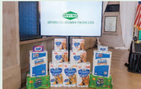
Irving Consumer Products is one of the largest paper and tissue product producers in the world, and Macon-Bibb County will be the site of the company's second U.S. facility.