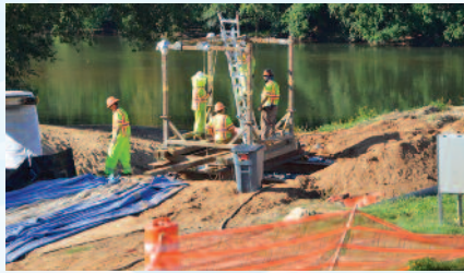
The precautions and innovations used by the MWA during its pipe lining rehabilitation project along the Ocmulgee River garnered the Authority inclusion in this year's Clean 13 list of organizations going the extra mile to protect Georgia's water.

The MWA was recognized specifically for its