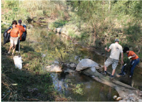
Volunteers clean portions of the stream running through the Historic Riverside Cemetery during the 2013 Ocmulgee Alive!