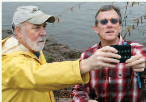
The MWA will be hosting Georgia Adopt-A-Stream training workshops on Saturday Dec. 12, providing local volunteers with an opportunity to obtain recertification for chemical and bacterial monitoring of local waterways.

The MWA is a proud partner with Georgia Adopt-A-Stream, even providing test kits on loan for use